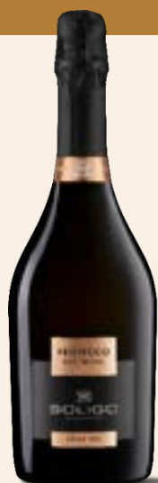
PROSECCO DOC TREVISO Extra Dry

A very classy Prosecco with aromas of fresh fruit, biscuit bread and flowers ranging from acacia to lily and lily of the valley. Subtle hints of aromatic herbs. Delicate, harmonious and pleasantly persistent on the palate.