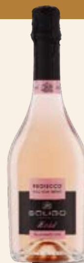
PROSECCO DOC TREVISO Millesimato Rosé Brut

A sparkling wine from our vineyards in the province of Treviso and made using the Charmat Method. Fresh, smooth and balanced, this Extra Dry has won over the palates of the many international juries that have awarded it numerous prizes. Its persistence is driven by a tanginess that characterises the finish.