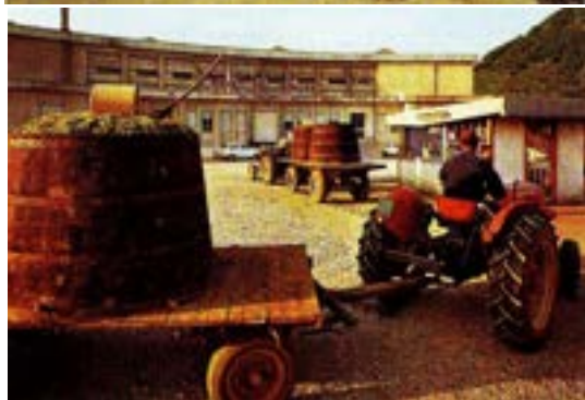
Facilities The delivery of the grapes in the 70s. Collection center, vinification, sparkling and bottling plant in Pieve di Soligo.