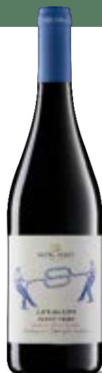
'LEVIGATO' PINOT NERO Marca Trevigiana IGT

Born from the desire to maintain a strong link with the past, this line is dedicated to lovers of still wine and is produced to bring out the typical characteristics of each variety and the qualities that the land gives to them.