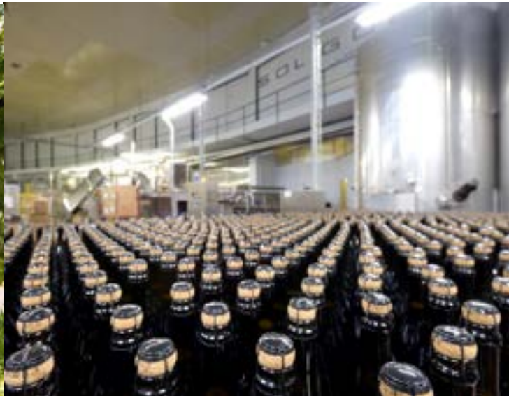
Our bottling line in Pieve di Soligo.