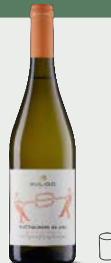
SAUVIGNON BLANC Marca Trevigiana IGT

The pedoclimatic environment allows Pinot Grigio to best develop all its typical components such as acidity and a broad fruity aromatic bouquet. Bright straw yellow in colour, it is delicate and fresh on the palate, with good balance.