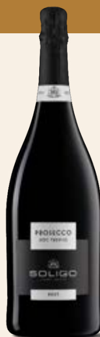
PROSECCO DOC TREVISO Brut

0,200 L 0,375 L Magnum Cod. SPEX0 Cod. SPEX375 1,5 L Cod. SPME3