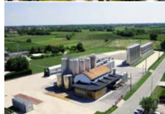
Facilities Collection center and vinification plant in Arcade (TV)