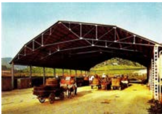
Facilities The delivery of the grapes in the 70s. Collection center, vinification, sparkling and bottling plant in Pieve di Soligo.

Today, our 600 members devote their time and efforts to the cultivation of 1,200 hectares of vineyards where approximately 85% of the grapes produced are of the Glera variety (Prosecco) and the remainder is Pinot Grigio, Chardonnay, Sauvignon Blanc, Merlot, Pinot Noir, Cabernet Franc, and Sauvignon. In 2019, selected vineyards were planted with Johanniter and Souvignier Gris vines, hardy varieties that demonstrate our growing commitment to sustainable viticulture .