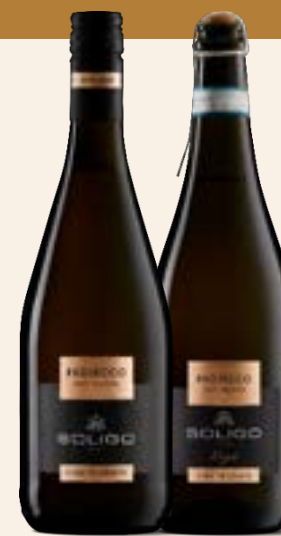
PROSECCO DOC TREVISO STELVIN-LIGÀ Semi-sparkling wine

A wine with unmistakable personality. The freshness and elegance of Glera is joined by 10% of Pinot Noir, which enriches the aromatic component and gives this wine a brilliant soft pink colour.