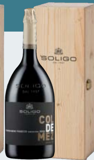
Jéroboam COL DE MEZ Extra Dry