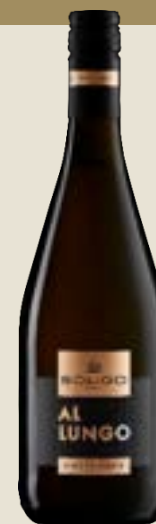
ALLUNGO Semi Sparkling wine

An Extra Dry sparkling wine suitable for every occasion made from white grape varieties from our own vineyards. In the winery, the grapes are softly pressed and a slow fermentation then begins in steel tanks using selected yeasts.