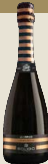
ALLUNGO Millesimato Spumante Extra Dry

A wine of great drinkability, an excellent companion in moments of cheerful conviviality thanks to its freshness of flavour: aromas of white pulp fruit are accompanied by a mineral finish.