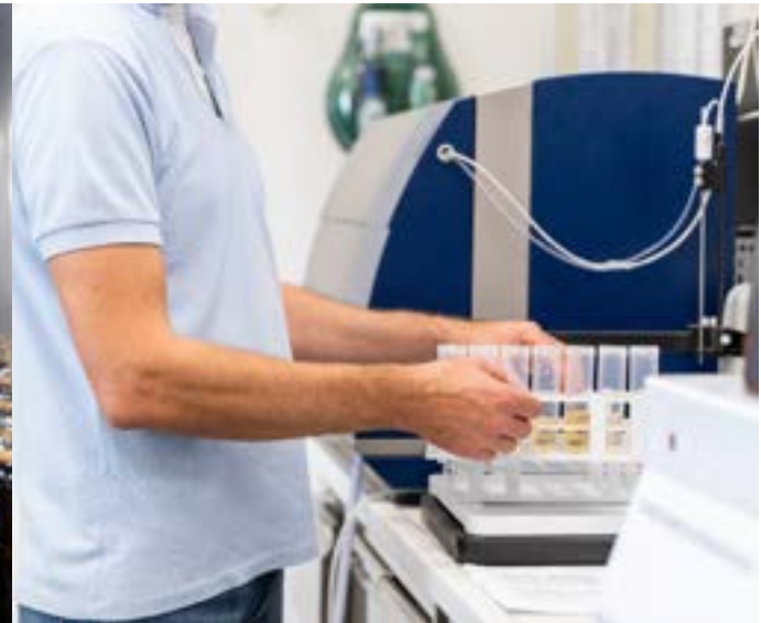
Our oenological laboratory in Pieve di Soligo.