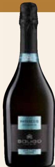
PROSECCO DOC TREVISO Millesimato Extra Dry

Passion and tradition are the key features of these wines, which stand out for their freshness and delicate aromas. A line that is made from selected grapes from the province of Treviso, the heart of Prosecco DOC.