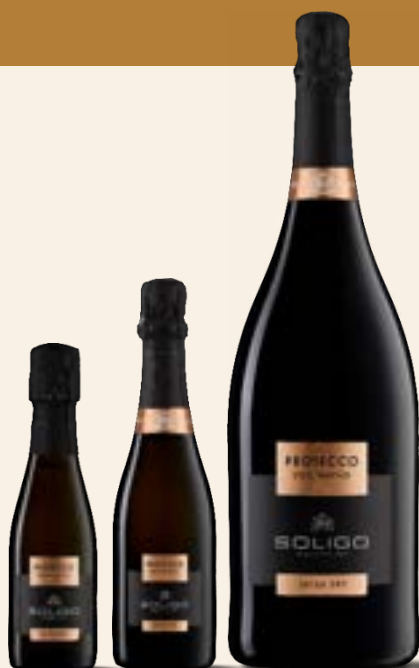
PROSECCO DOC TREVISO Extra Dry

0,200 L 0,375 L Magnum Cod. SPEX0 Cod. SPEX375 1,5 L Cod. SPME3