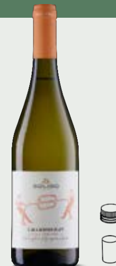
CHARDONNAY Marca Trevigiana IGT

A famous international semi-aromatic variety aged in steel to enhance its typicality, this wine stands out for its elegant olfactory intensity and freshness of flavour. Its broad recognizable bouquet is direct with citrusy hints of citron, Grapefruit and tomato leaf.