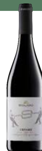
'CESARE' Colli Trevigiani IGT

The grapes are harvested when fully ripe in order for maximum development of the phenolic component. In the winery, fermentation on the skins begins for 15 days in steel vats. This is followed by a minimum of 6 months' ageing in steel tanks. A part then rests in large casks for 5 months.