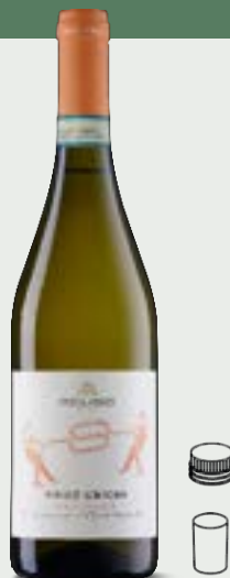
PINOT GRIGIO DOC delle Venezie

A Conegliano Valdobbiadene of rare authenticity. Its fruity notes are accompanied by the floral ones typical of the Glera grape from a single vineyard in the Conegliano Valdobbiadene DOCG area.