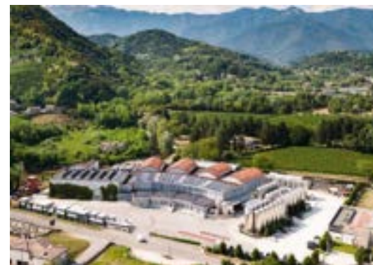
Facilities Collection center, vinification, sparkling and bottling plant in Pieve di Soligo