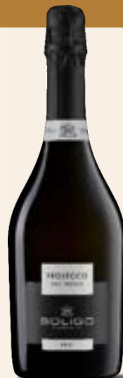
PROSECCO DOC TREVISO Brut

Its selection of grapes makes this Millesimato incredibly elegant and representative of every vintage in our area. It is full and pleasantly savoury on the palate, characterised by a long and pleasant finish.