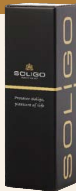
MAGNUM GIFT BOX