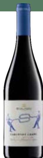
CABERNET FRANC Marca Trevigiana IGT

The grapes come from our vineyards north of Treviso: they develop their aromatic and phenolic components to the full. A balanced wine with soft tannins and a good freshness of flavour. On the nose it offers aromas of plum and cranberry, floral notes of violet and a hint of vanilla.