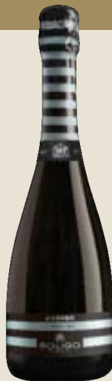
ALLUNGO Millesimato Spumante Brut

Blending different grapes to create sparkling wines with winning versatility, perfect for any time of day.