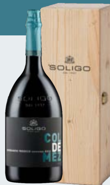
Jéroboam COL DE MEZ Brut